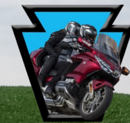
A Wing'd Rider District Member