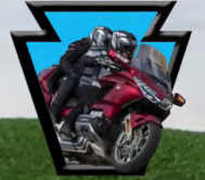
A Wing'd Rider District Member