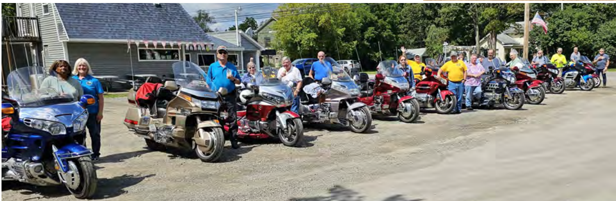
Left, Chapter R guided ride at District Rally