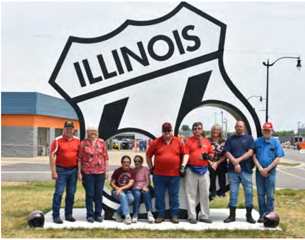
Left, June-July trip to Rally #1