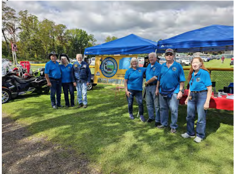
September Fall Festival