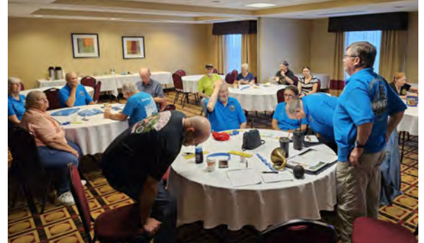
Right, July Gathering