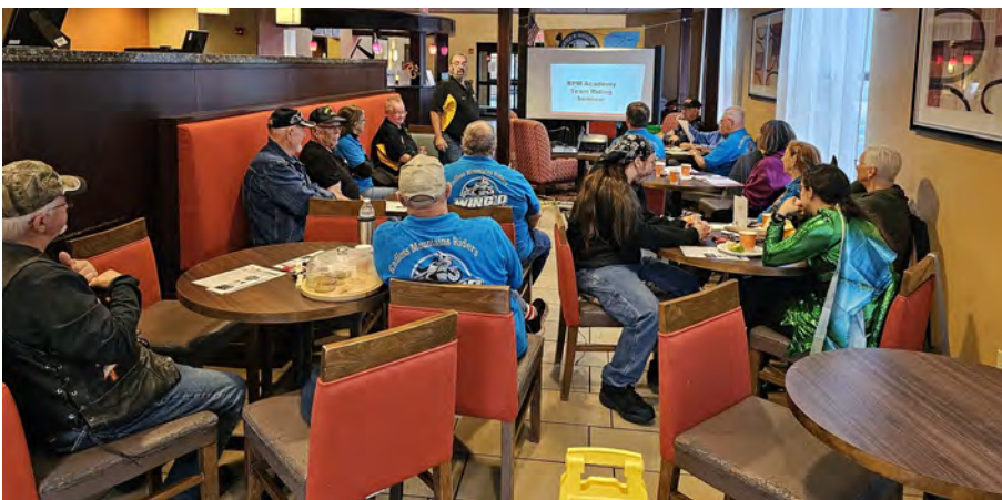
October Gathering Training - Halloween style!