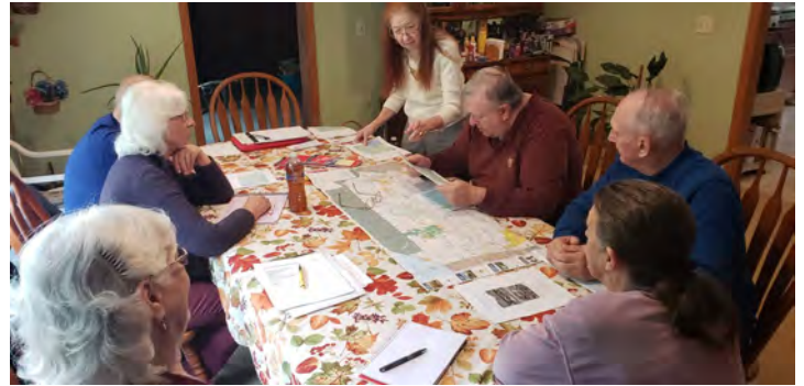
May Planning for Rally Trip