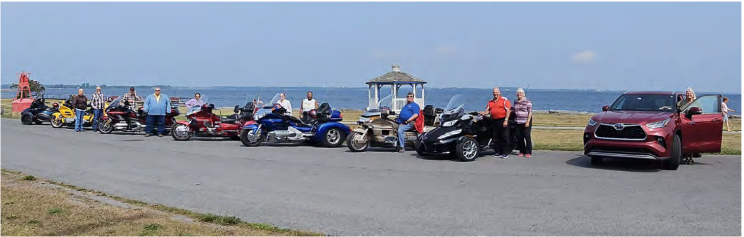
Above, July trip to Alex. Bay.