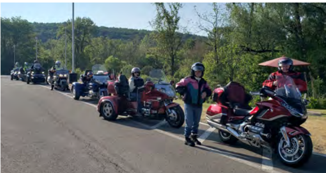
Left, June Dice Run.