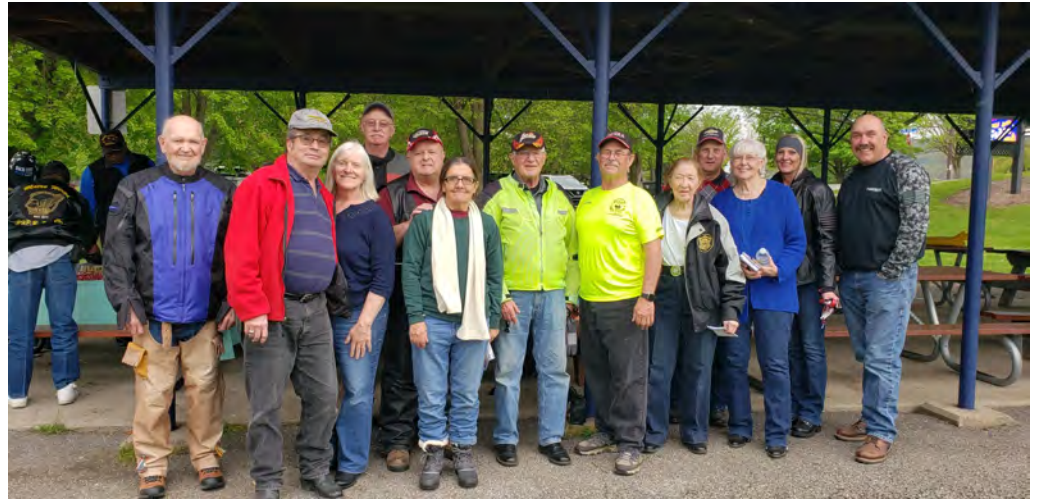
May Hobo Stew Ride