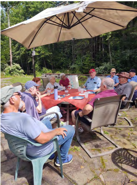
September Hot Dog Roast