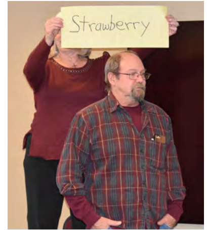
Right, March Ice Cream Party