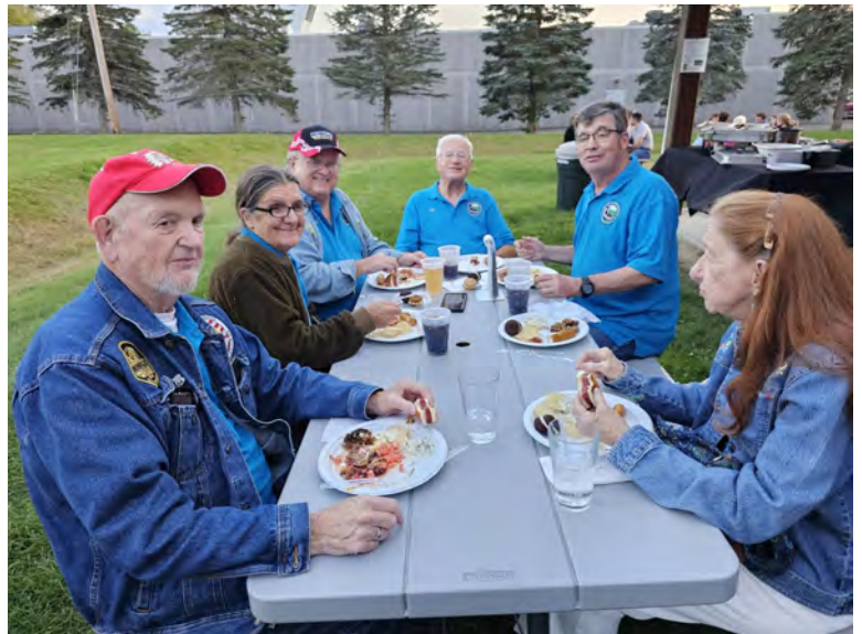
October Chamber Mingle