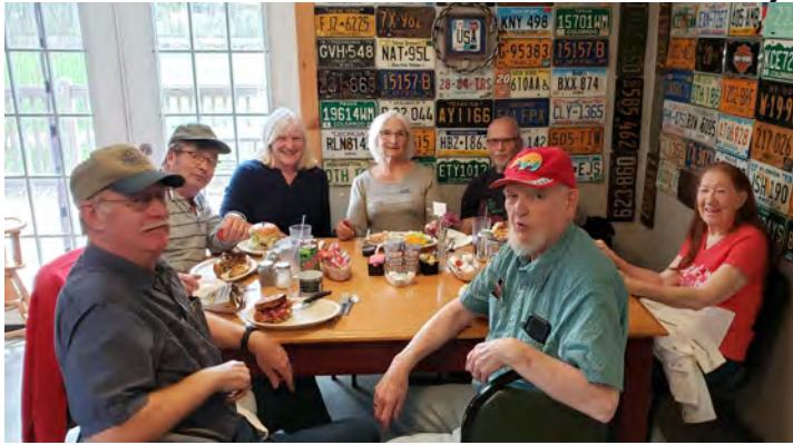
April Ride & Lunch