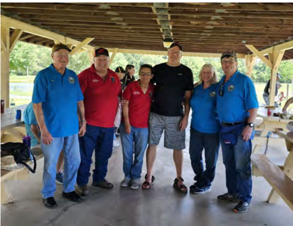
Right, Talent Show at District Rally