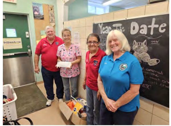
Right, Raising donations for shelters at Gumball & District events.