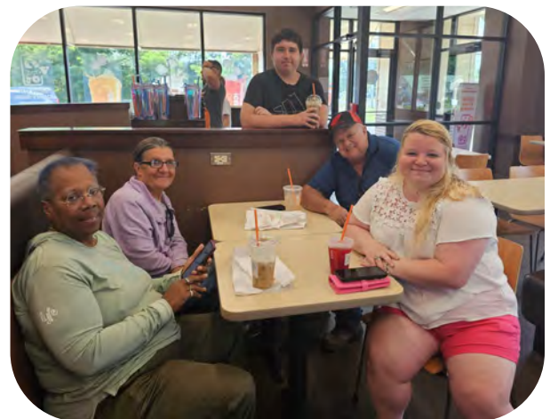
A special treat on the Alexandria Bay trip was getting a quick visit with our grandson and granddaughter as we passed through Pulaski.